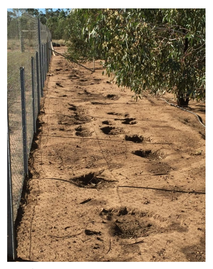
Figure 3-2 Inner range area of Shed B at clean out, showing hollows excavated by hens along boundary fence