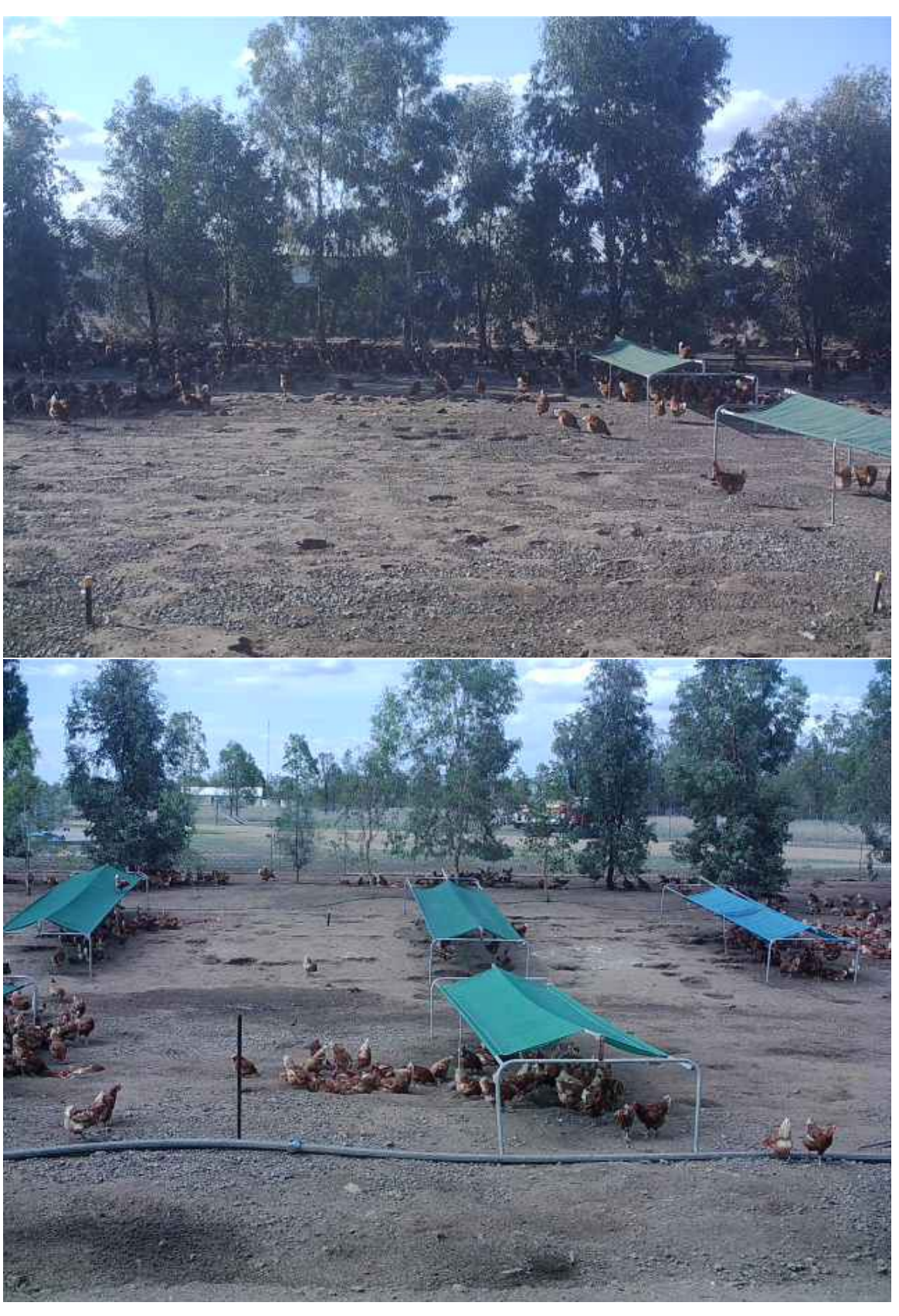
Figure 3-4 Remote camera images the inner range area showing hen ranging behaviour for Shed A (top) and Shed B (bottom) at a flock age of 50 and 52 weeks, respectively

Portable shade structures and native trees can be seen in the middle and backgrounds of both images.