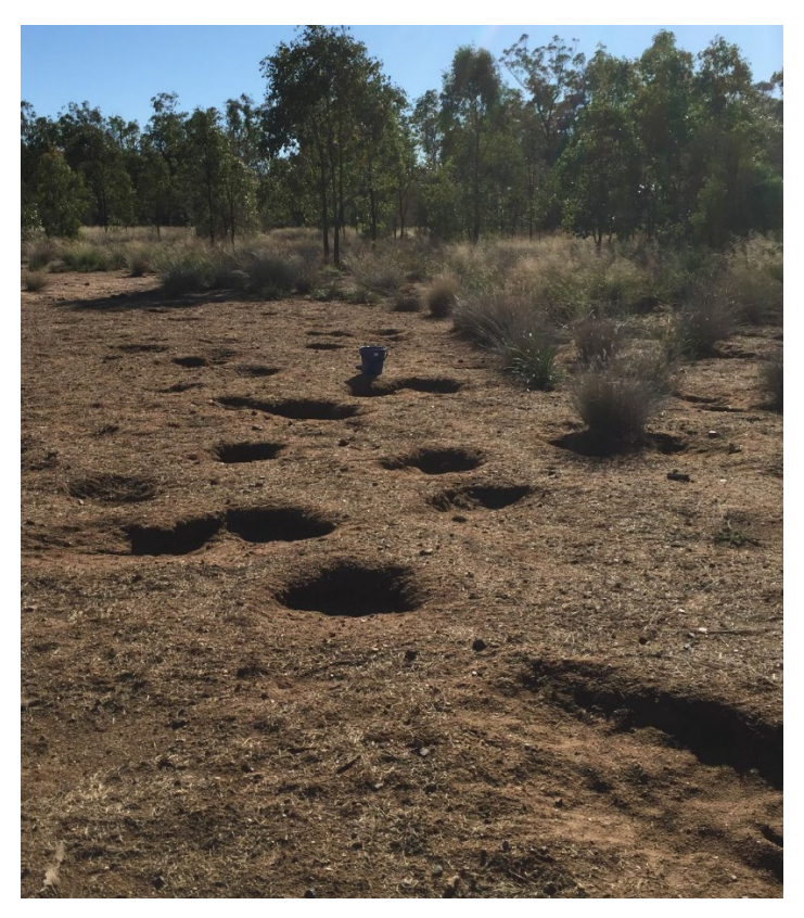
Figure 3-3 Outer range area of Shed B at clean out, beyond the manure pile, showing hollows excavated by hens

A 10 L plastic bucket in the centre of the image provides scale.