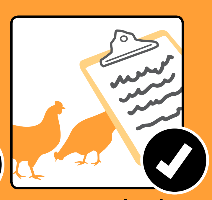
Monitor bird health