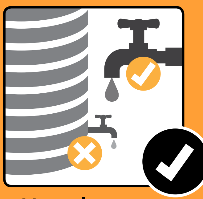
Use alternate source