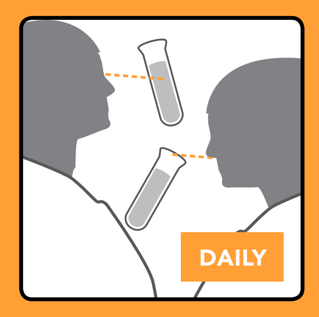
Look and smell