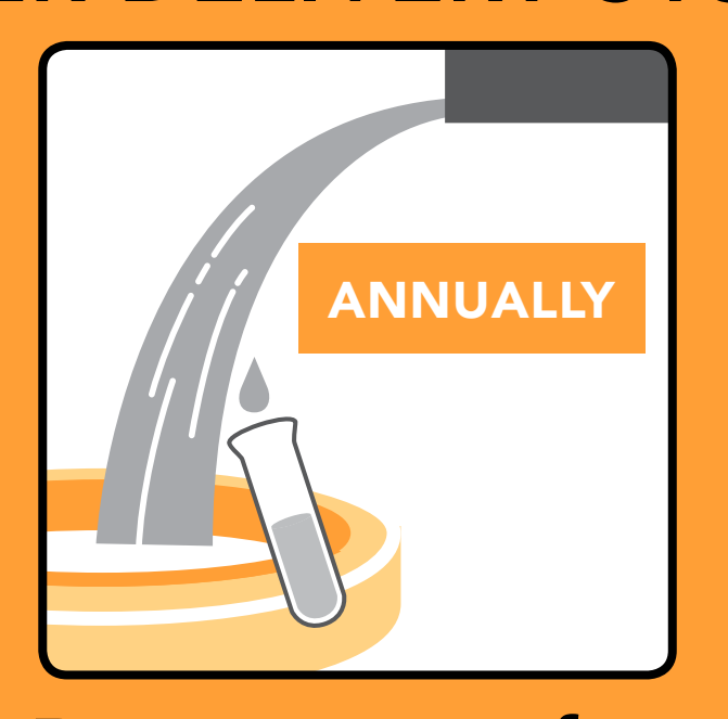
Bore water safety