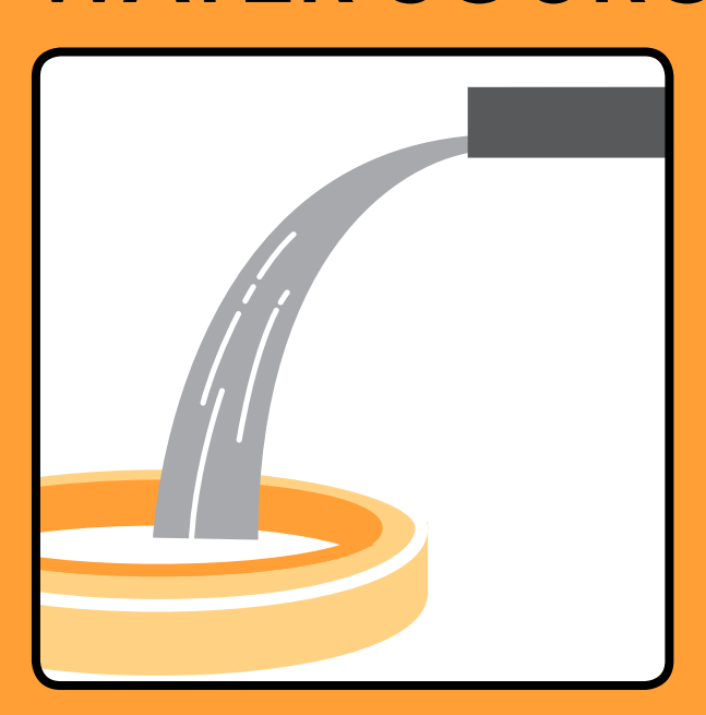
Quality bore water