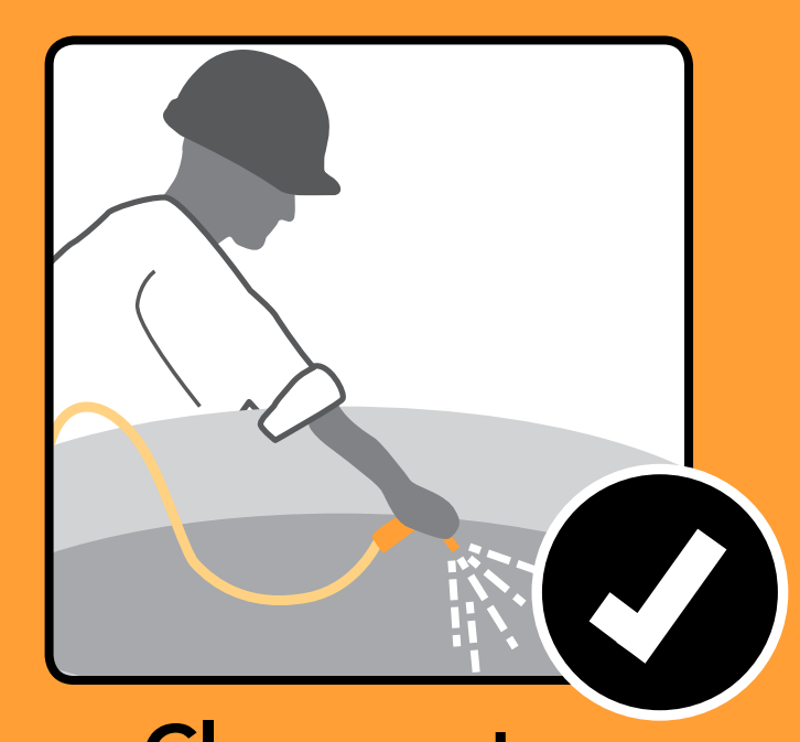
Clean water system