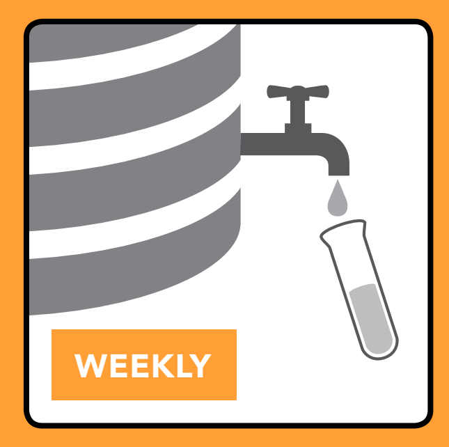
Sanitised water test